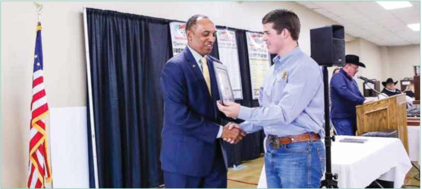
Student receiving award from Comanche County Saddle & Sirloin Club.