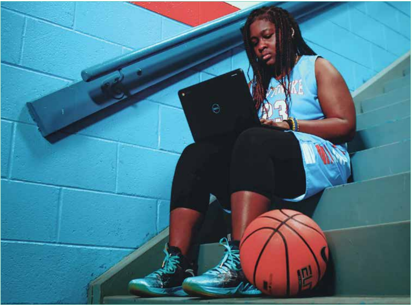
Student using new Chromebook provided by community grant.