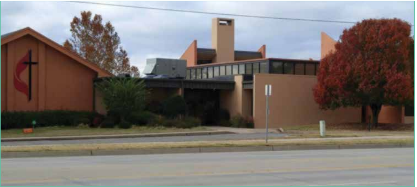
St. Paul's United Methodist Church