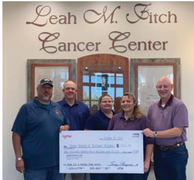
Bar-S Foods employees demonstrate charitable values by delivering a donation to Lawton nonprofit.

The Lawton Community Foundation exists to simplify giving for those who are charitably minded. Whether it’s connecting a donor to an organization who shares their charitable interests, helping a donor leave a legacy in the most tax-efficient way possible or streamlining charitable giving for a busy organization, the Community Foundation is here to help.