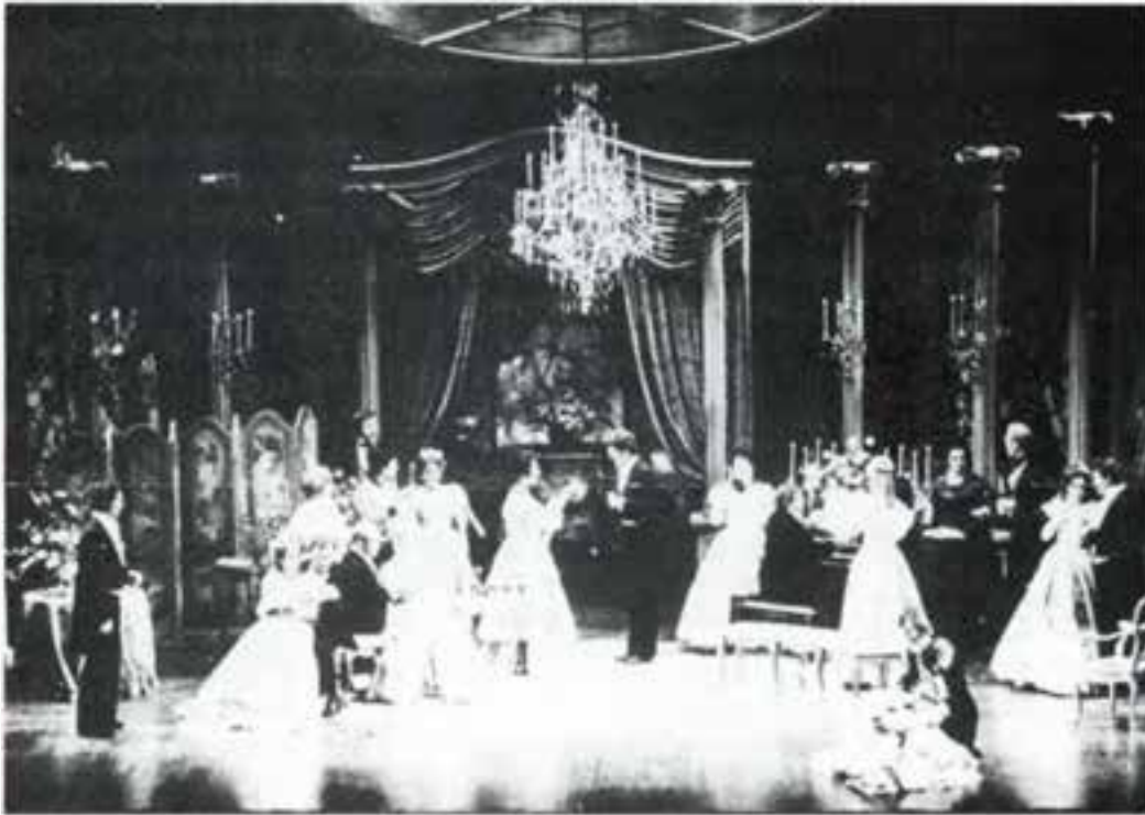
LA TRAVIATA TO BE PRESENTED MARCH 13, 1979

The Oklahoma Symphony Orchestra will present the Tulsa Opera production of La Traviata by Giuseppe Verdi (in Italian) March 13 at Civic Center Music Hall.